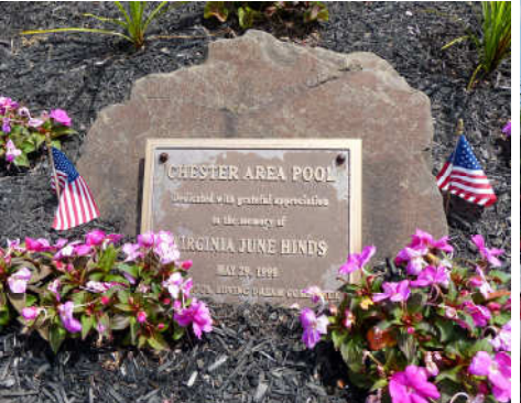
Plaque honoring June Hinds