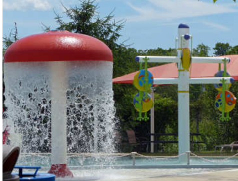
Fun pool showering mushroom